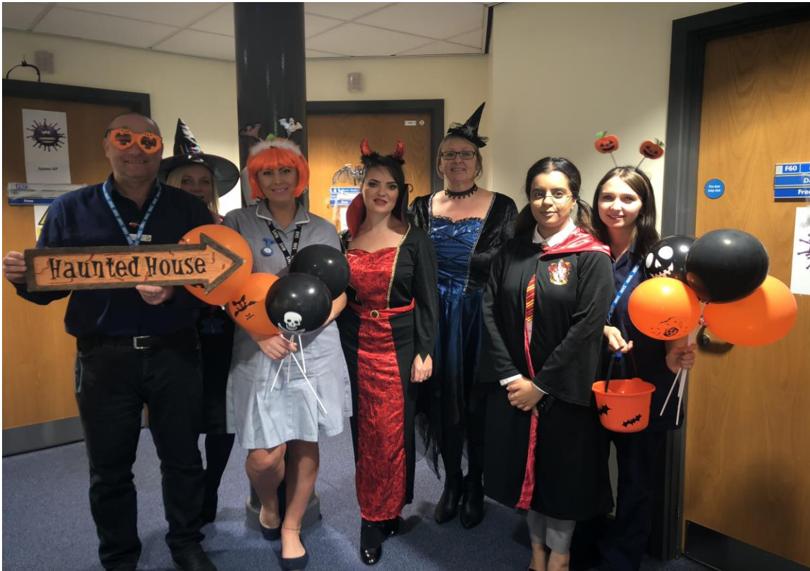
This image was provided by the practice and is on their public website.

On Halloween week the practice staff announced a "Spooktacular event" whereby children attending the surgery could dress up in Halloween costumes, as did staff, to encourage the uptake of the flu jab, followed by trick or treat sweets.